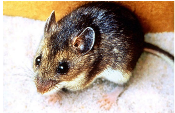
Figure 2. Deer mouse.

activities. Deer mice are native to Montana and may be found throughout the state from the grasslands to the mountains. Deer mice may be identified by the sharp color line on their tail, from brown on the top to white on the bottom. The house mouse tail is brown and grayish, without a sharp line. Female deer mice have three to four litters per year with three to five young per litter. Populations tend to spike in the fall.