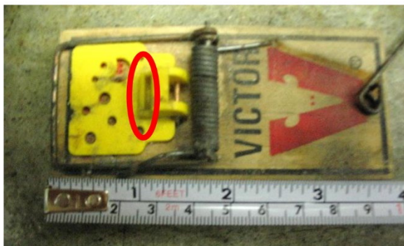
Figure 10. Place bait in the cup identified by the red circle.

Pre-baiting unset traps is strongly advised to condition the mice to the bait and traps (Fig. 10). Place baited and unset traps in areas where mice are active. Check traps each morning as mice are most active during the evening. Rebait as needed. Add additional traps in areas where activity is high. After a few baiting cycles, set all the traps. Experience has shown that this method increases the speed of trapping programs.