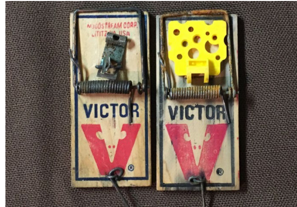
Figure 7. Traditional trigger (left) and expanded trigger (right) mouse traps.

Snap traps come in a variety of models and designs. All are effective in catching mice. Traps with expanded triggers, however, have a higher capture rate. (Fig. 7).