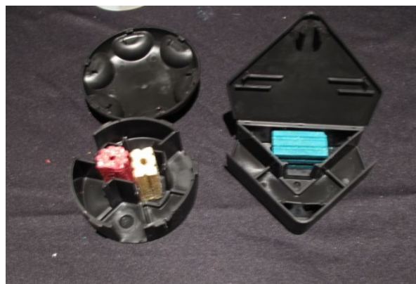
Figure 12. Two different styles of bait stations for mice designed for indoor use.

are designed to protect bait from non-target access (Fig. 12).