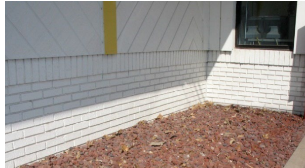
Figure 6. Crushed stone provides a superb weed-free barrier.

Habitat modification and sanitation reduces both the conditions attractive to mice and the ability of resident mice to survive. Mice cannot maintain large populations when the availability of living space and food are restricted. Reduce the attractiveness of structures by creating a three-foot wide weed-free barrier around the structure. Crushed stone (one-inch diameter) to a depth of three inches or more is best but even bare soil will do. Research shows that mice do not like to cross areas lacking cover (Fig. 6).