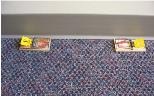
Figure 9. Traps set side-ways against a wall.

If you must place traps sideways against walls, then be sure the triggers of the traps face outward, as in Figure 9.