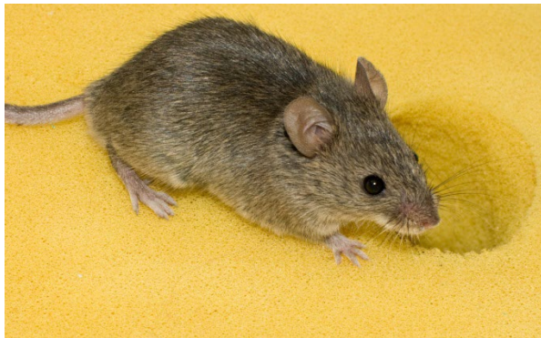
Figure 1. House mouse.

House mice (Fig. 1) are small rodents that weigh slightly less than an ounce and average 6½ inches in length including a three-inch tail. Though not native to the United States (they originated in Asia), house mice are adaptive enough to human environments that they can be found wherever people are throughout Montana. House mice reproduce year-round. Females can have four to six litters of five to seven young each year.