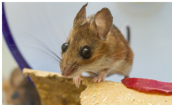
Figure 3. White-footed mouse.

Mice should not be confused with voles (Fig. 4). Voles have stocky builds, blunt noses, and short tails (long-tailed voles being the exception). Their ears are less pronounced, often with only the top half visible above the fur. Voles rarely enter structures but may be found in adjacent landscapes.