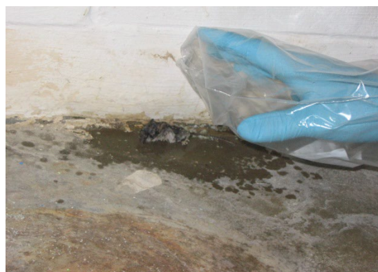
Figure 14. After spraying disinfectant on the mouse, pick it up with a gloved hand inside a plastic bag.

Turn the bag right side out so that the mouse is inside the bag. Seal the bag. Wrap the bagged mouse in newspaper or place it in a box and dispose of it with other household wastes. Spray the trap and area of the original set with disinfectant and let dry. Carefully remove your gloves by turning them inside out and dispose of them with other household waste. Wash your hands thoroughly. Be aware that some disinfectants may stain surfaces, carpets, and fabrics.