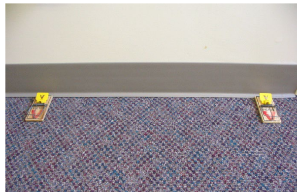
Figure 8. Traps set abutting a wall.

Set triggers lightly so the traps will spring easily. Mice almost always follow walls, so place the traps with the trigger side abutting the walls (Fig. 8). Traps positioned in this way can be baited or not. If you decide to bait, use peanut butter, caramel, chocolate, whole canary grass ( Phalaris canariensis ) seed, or nesting material, such as cotton balls and soft cloth.