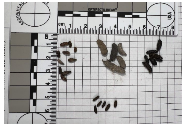
Figure 5. Droppings: Top row: Left to Right: House mouse, Norway rat, roof rat. Bottom row: Deer mouse. Each square is 5 mm.

Droppings provide conclusive evidence for the presence of rodents. Droppings average \frac{1}{8} to \frac{1}{4} inch in length with one or both ends narrowing to a point (Fig. 5). On rare occasions the droppings will appear round. The droppings are usually black in color but will vary according to the mouse's diet. Droppings of deer and white-footed mice will look similar.