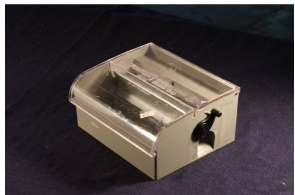
Figure 11. Tomcat multiple live catch mouse trap.

Multiple-capture traps for mice, such as the Victor Tin Cat®, Ketch-All® and Tomcat® (Fig. 11) can catch several mice at a time without being reset, thereby reducing labor requirements.