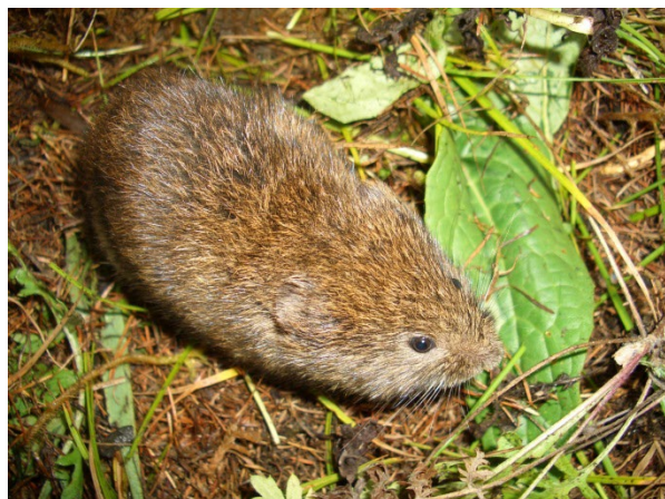
Figure 4. Meadow vole.

Mice should not be confused with voles (Fig. 4). Voles have stocky builds, blunt noses, and short tails (long-tailed voles being the exception). Their ears are less pronounced, often with only the top half visible above the fur. Voles rarely enter structures but may be found in adjacent landscapes.