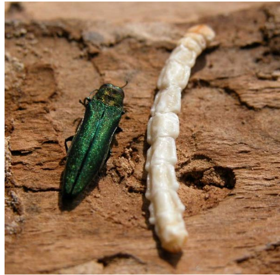
Figure 1: EAB Adult and Larva

This problem pest is mostly transported in firewood and infested nursery stock. EAB only targets Ash trees ( Fraxinus spp. ). Currently the EAB is found in most states from the mid-west to the east coast, as well as South Dakota and Colorado. There is currently a quarantine at the federal level to control the spread of EAB.