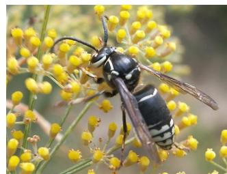
Bald-faced Hornet ( Dolichovespula maculata )