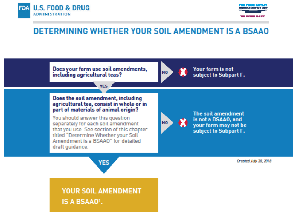
Figure 4a. Determining Whether Your Soil Amendment is a BSAAO